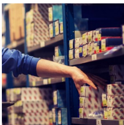
In the warehouse

The compact scale S110 is particularly suitable for use in the warehouse. It is compact, handy and can also be used as a mobile scale thanks to the optional battery operation. This allows you to flexibly carry out short checkweighing operations at any time.