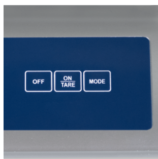
Easy to use

The scale can be operated very easily with the two keys "ON/TARE" and "OFF". The tare function allows the weight to be determined without a container. With the mode key, the unit can be changed from kg to lbs.