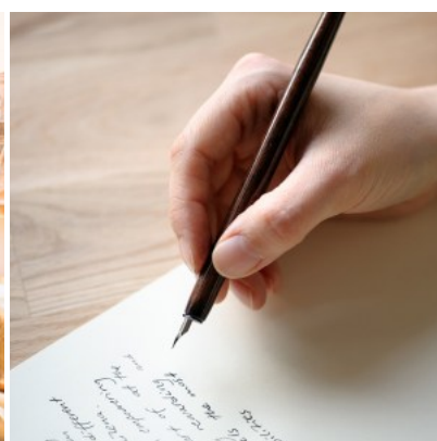
In the household

The Scaleson compact scale S110 can also convince in retail and markets. It can be used as a checkweigher for quick and easy weight control of food, ingredients and other products.