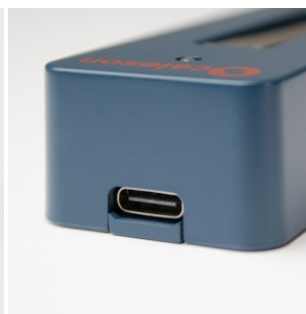
Quick charge in only 5 minutes

The Scaleson Grill and Fry Thermometer S410 has two temperature sensors and thus enables monitoring of the internal temperature of the oven or grill in addition to monitoring the core temperature of the food being cooked. The temperature sensor for the core temperature is made of stainless steel. The sensor for the internal temperature of the oven is encased in PEEK (thermoplastic high-performance plastic).