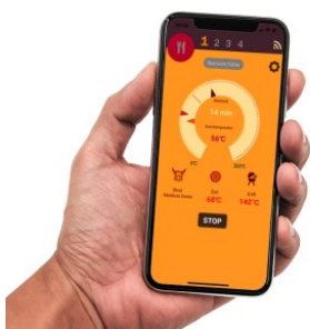
Free app available

Keep an eye on the cooking process at all times with the free app. This way you can spend time with your guests, family or friends without having to stand in the kitchen or at the grill all the time. As soon as the food has reached the preset temperature, an alarm sounds to inform you.